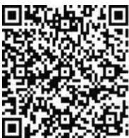
Addl. Controller of Examinations